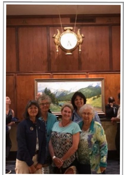
ANCW Mid-Year Meeting attendees at the Brown Palace in Denver, CO