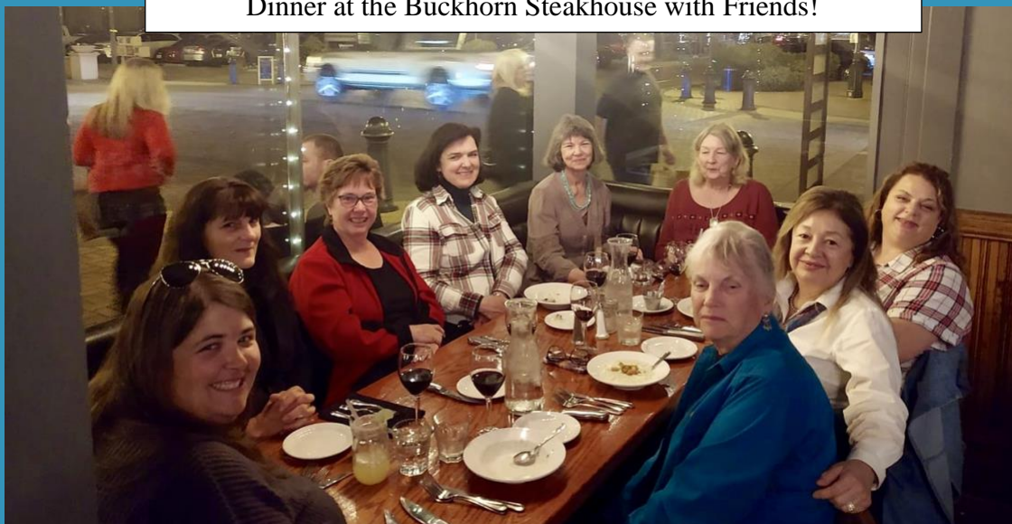
Dinner at the Buckhorn Steakhouse with Friends!

PROMOTING AGRICULTURE IN OUR COUNTY AND AROUND THE NATION