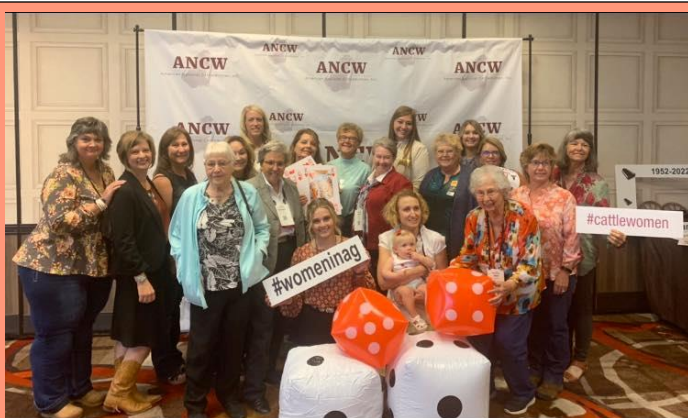
Region 6 Ladies having a great time!