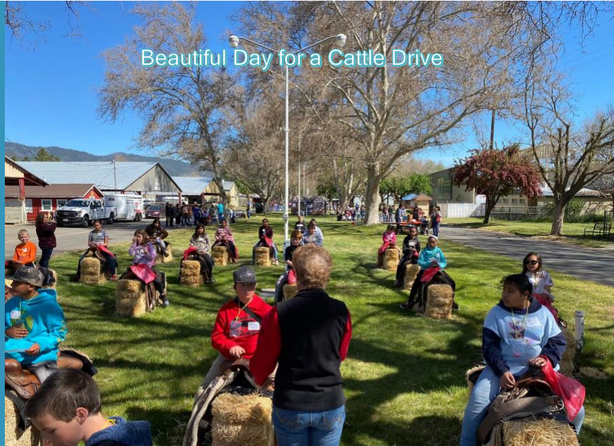
Beautiful Day for a Cattle Drive

PROMOTING AGRICULTURE IN OUR COUNTY AND AROUND THE NATION